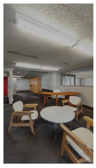
(Left) Barcode No. 3, Mezzanine 3rd Floor Balcony and Clerestory Gallery (Right) Former Director's Office

NB: The above content is current as of July, 2023. The program title, contents, and installation period are subject to change.